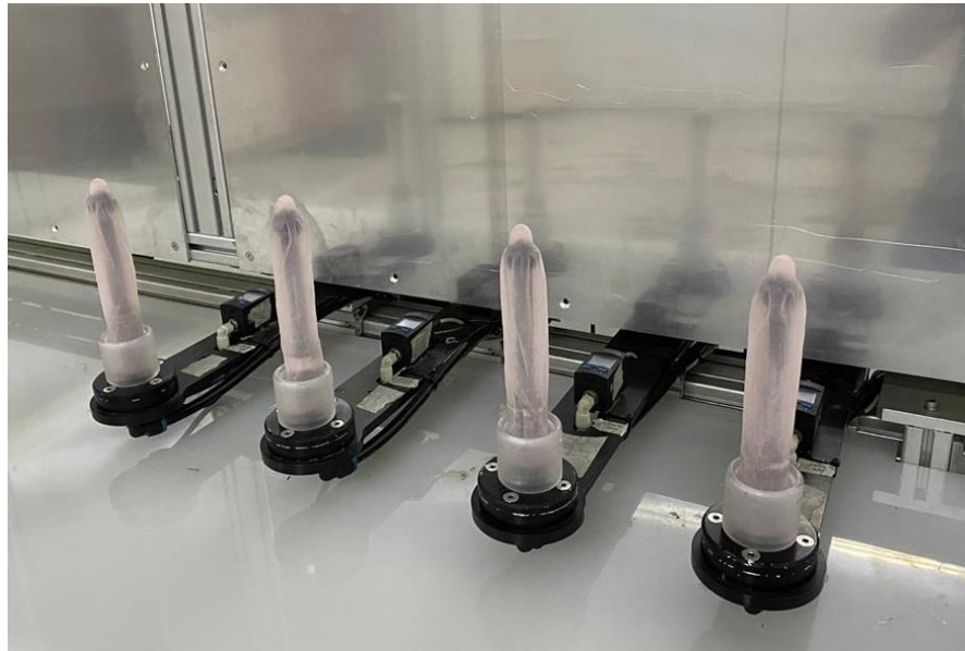
DBT- 4 chambers